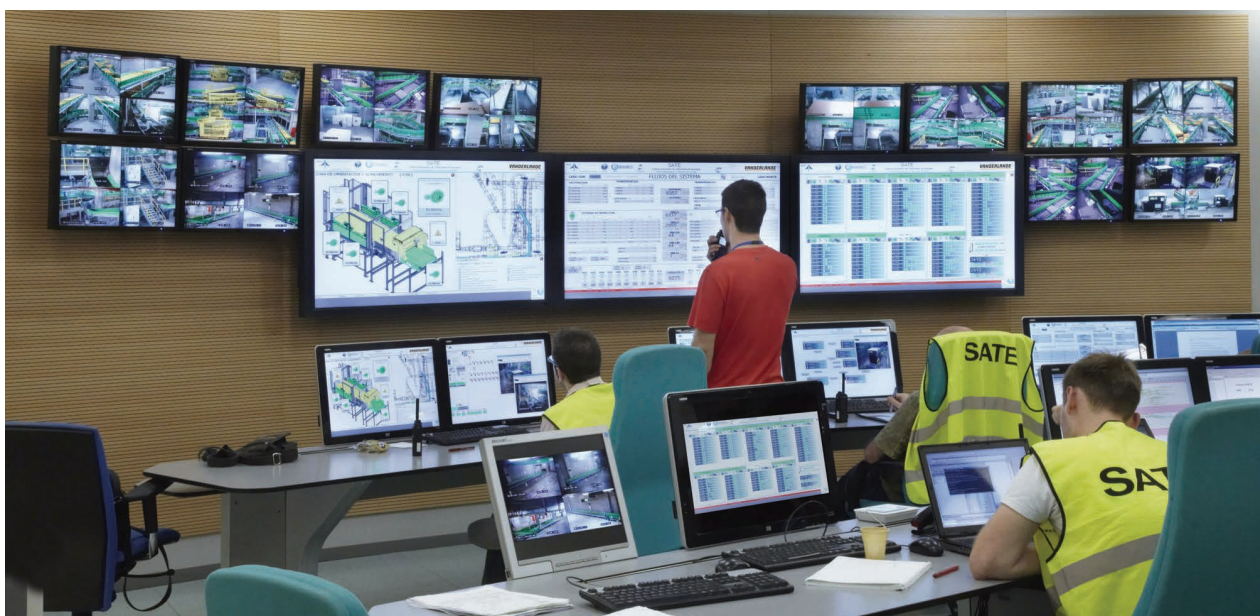
Figure 2. A baggage control room with a variety of software- and communication systems.

Furthermore, technology and its integration in society has changed substantially in ten years' time. Artificial intelligence for example has taken a leap, also in private use. Having intuitive smartphones and tablets with apps that support the user by 'spontaneously' providing suggestions (e.g., 'it will take you 20 minutes to travel to work if you leave now') has resulted in higher expectations by users from technology and a more individualized and smoother user experience.